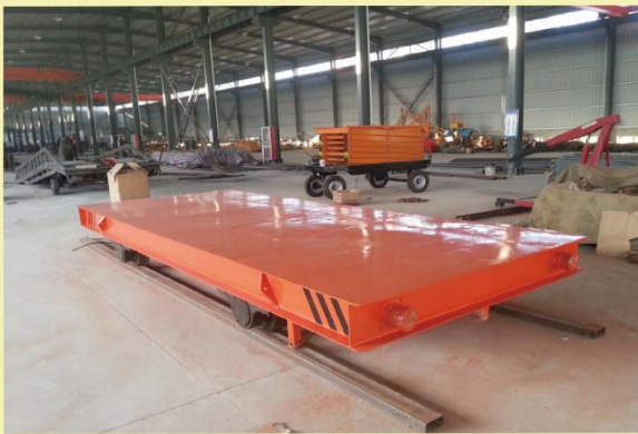
KPX---Battery Transfer Cart