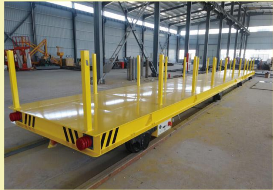
KPD---Low Voltage Transfer Cart